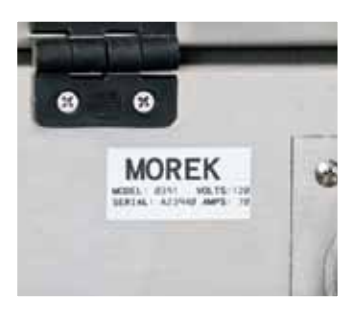
Rating Plate Labels