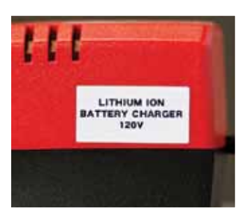
Rough Surface Labels