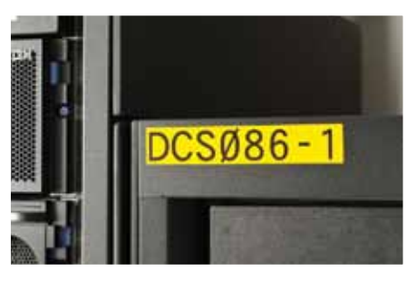
Data Centre Equipment, Bay, Rack & Frame Labels