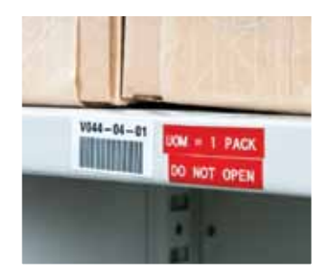
Bin, Storage, & General Industrial Labels