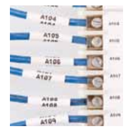
Terminal Block Markers