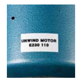
Automation & Electrical Component Markers