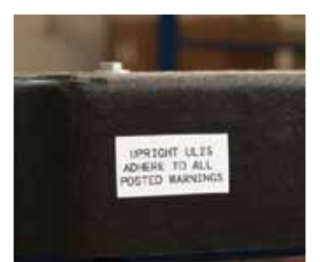
Low Surface Energy / Powder Coated Surface Labels