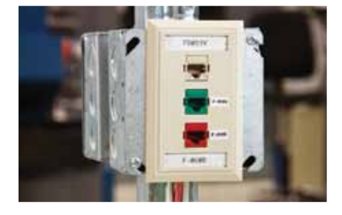
Faceplate & Outlet Labels