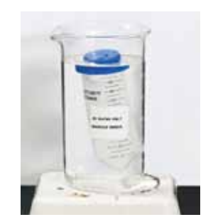
General Lab ID (Bottles, Flasks, and Dishes)