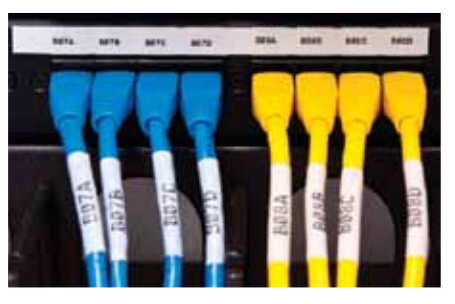
Self-Laminating Cable Markers