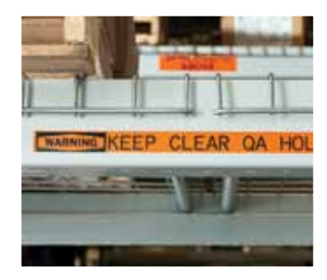
Indoor / Outdoor Grade Facility & Safety Labels