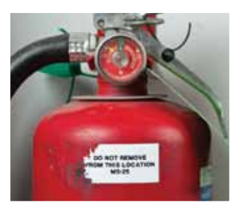
Tamper Resistant Labels