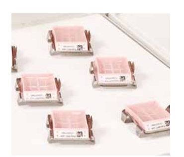
Tissue Cassette Labels