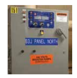
Control Panel and Electrical Panel Labels