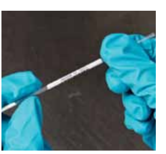
Straw and Rod Labels